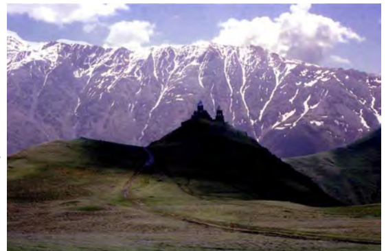
Holly Trinity Church in Kazbegi

In the following issues will bring you some interesting stories from Georgia's past history as well as current news.