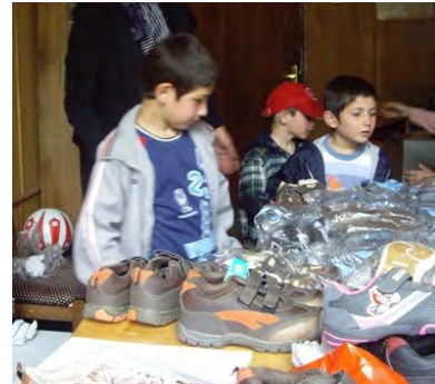
Something to wear

A couple of days later we were driving back towards