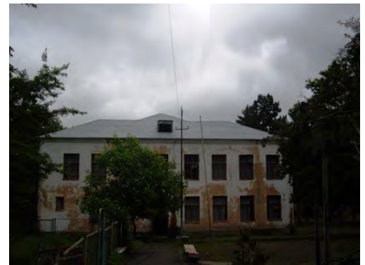
One of the orphanage buildings

I thought that I was prepared to enter their world of reality. But I was wrong. The conditions they are living in just emphasize even more how horrible their lives are, - no heat, no running water, no electricity, the buildings are so deteriorated with leaky ceilings and cracks, that it is hardly safe to be inside these structures.